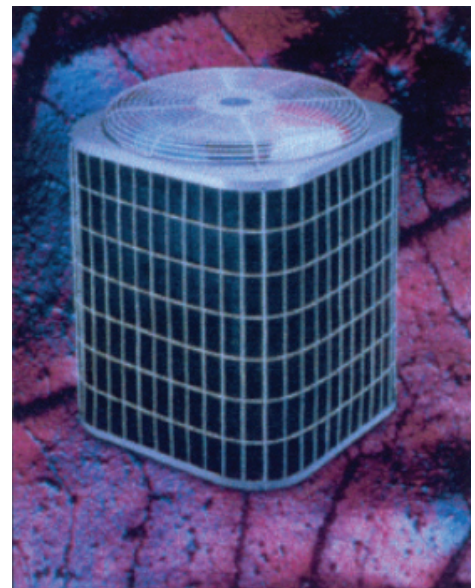
Application Shown: Residential heat pump

Small size, a variety of mounting options, and outstanding thermal response, makes the 3NT an excellent temperature control for dehumidifiers, freezers, heat pumps, ice makers, refrigerators, or any place where a fixed temperature control is required in a wet or dirty environment.