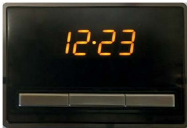
Large Frame, keyboard integrated

» The product is a monolithic electronic control integrated in plastic housing. It allows to manage time. The User Interface is made by Led display available in different colors and mechanical switches. The output is a power relay. Two sizes of housing are possible. An intergrated keyboard with 3 buttons is also available on the large frame.